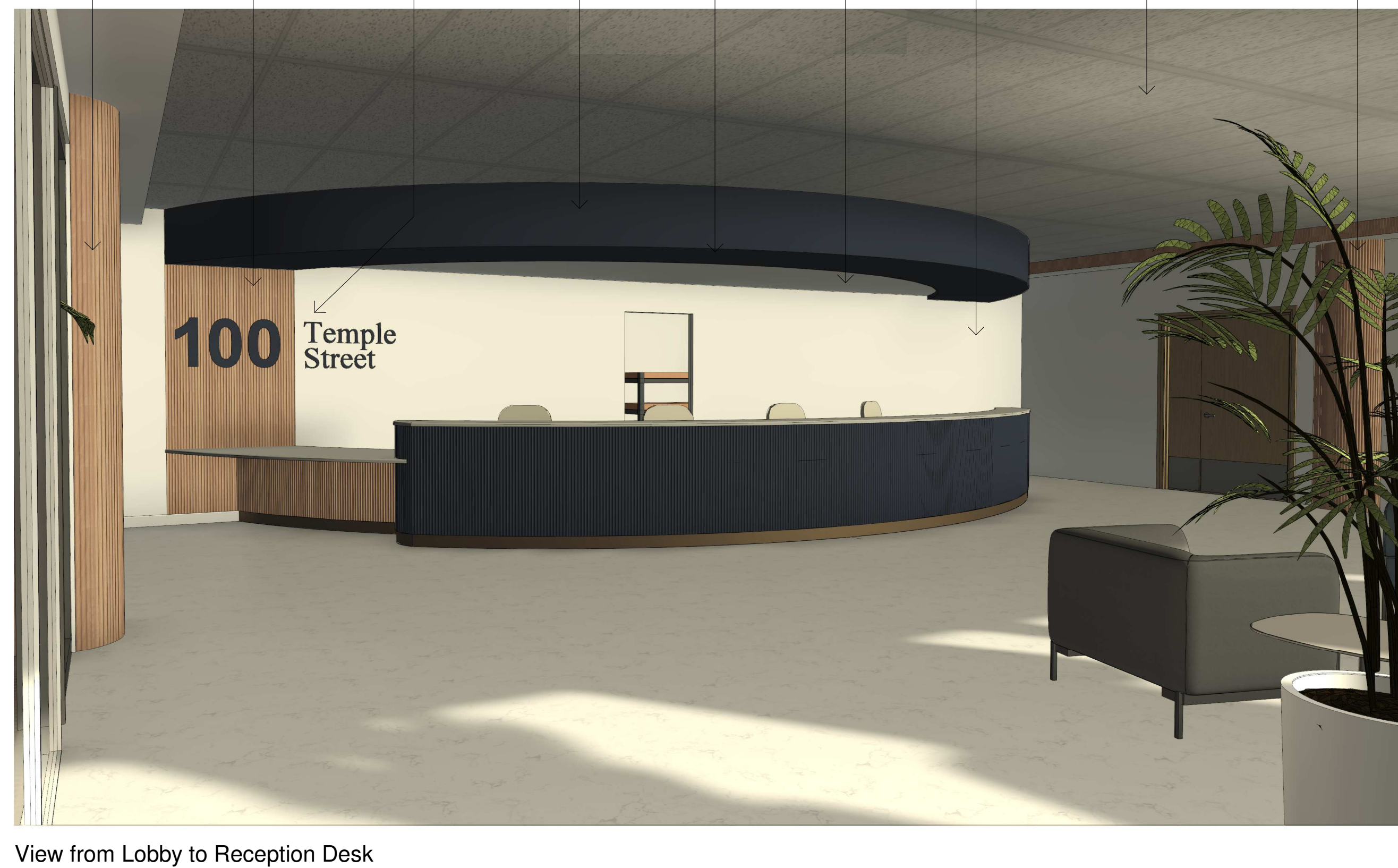
View of Reception from Temporary Partition

Bulkhead White plastereffect vinyl painted to match reception wallcovering desk colour