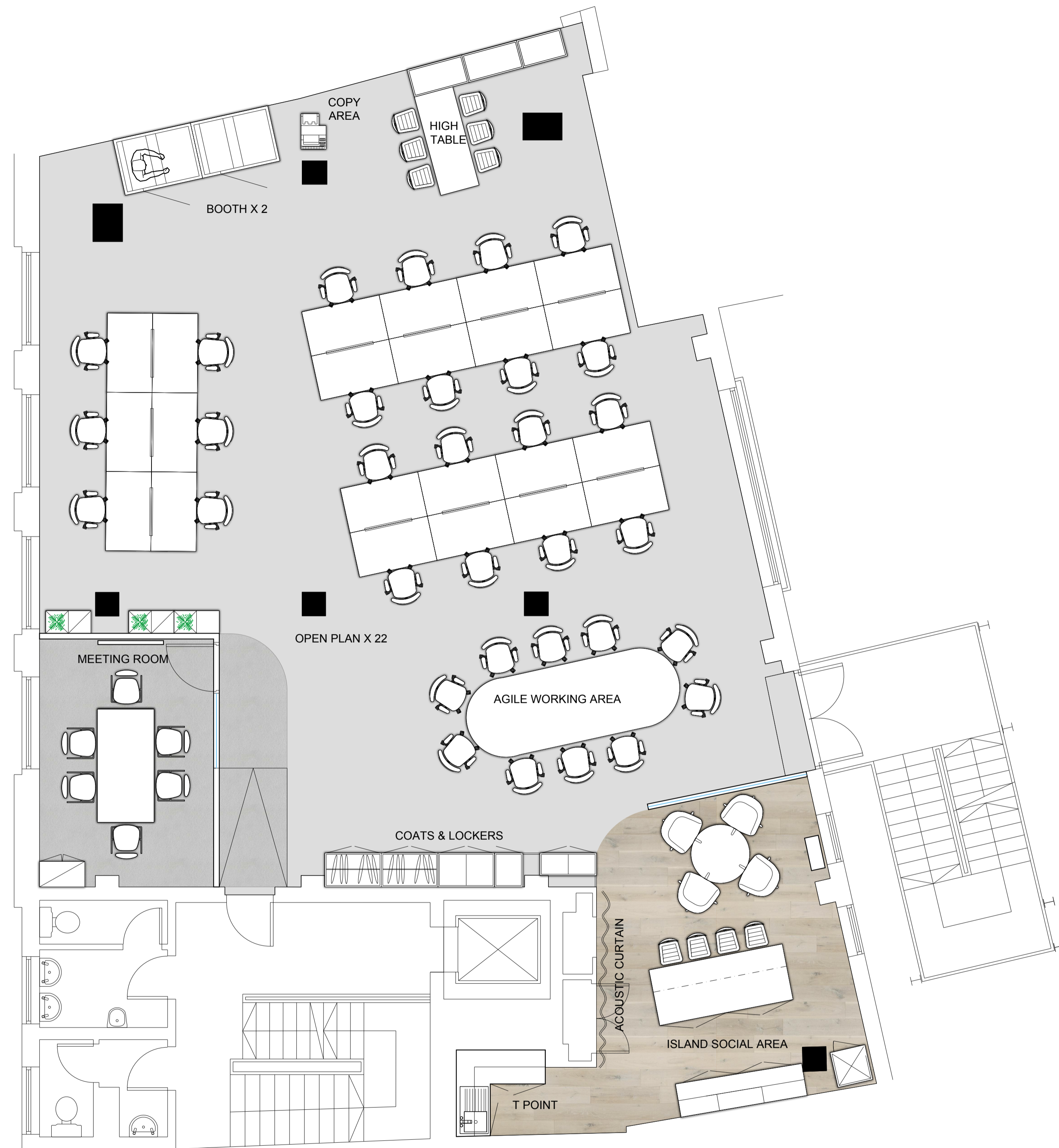
FRONT BUILDING FIRST FLOOR PLAN