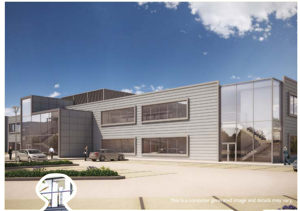
This is a computer generated image and details may vary.

“ WITH OVER 100 INTERNATIONAL BUSINESSES ”