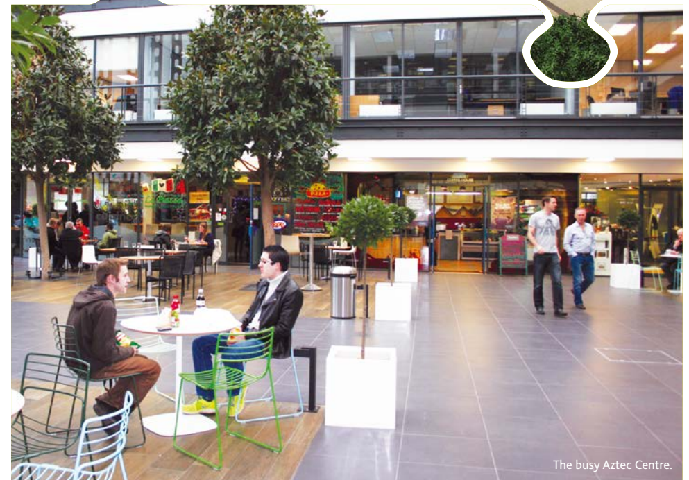
The busy Aztec Centre.