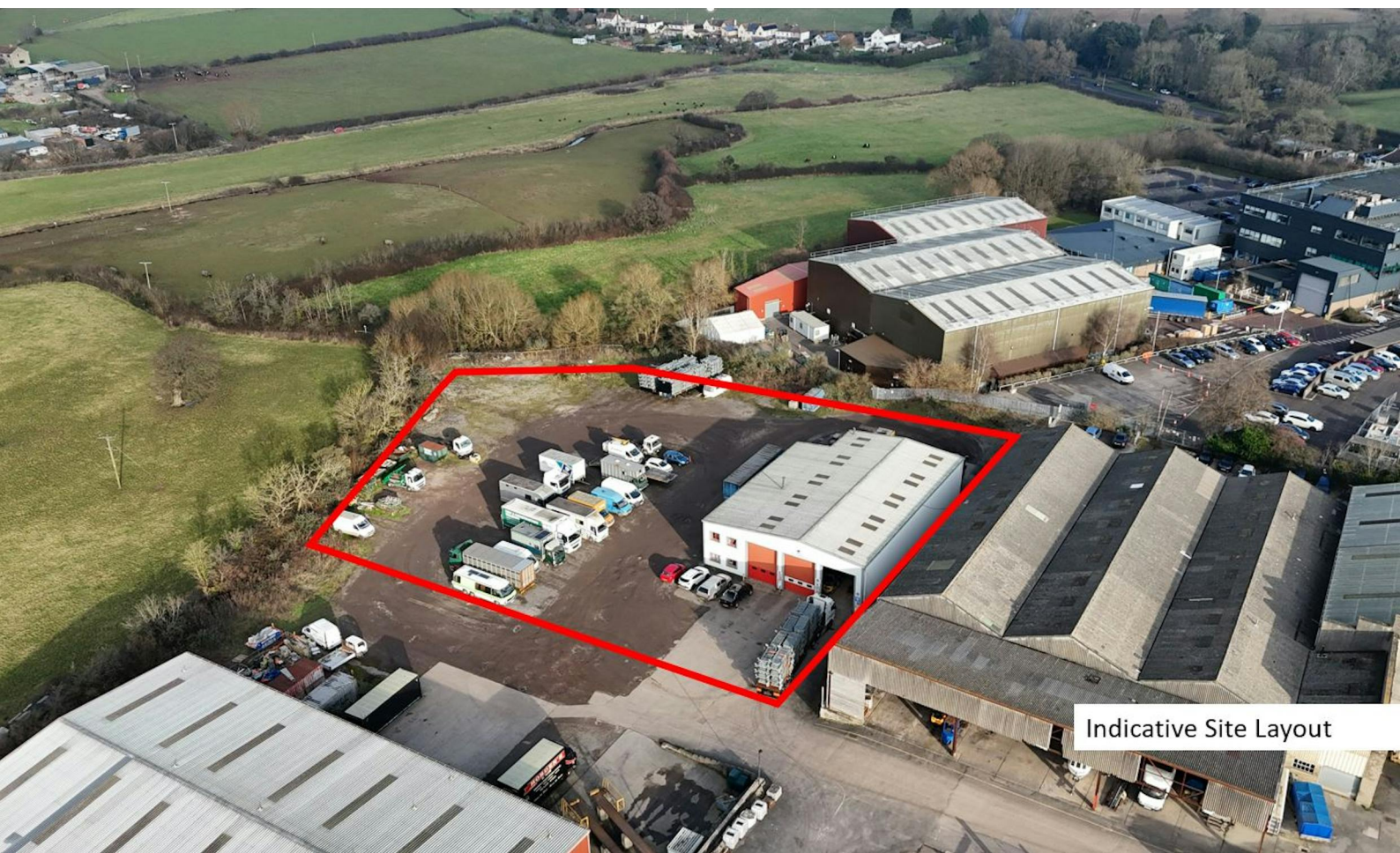
Indicative Site Layout