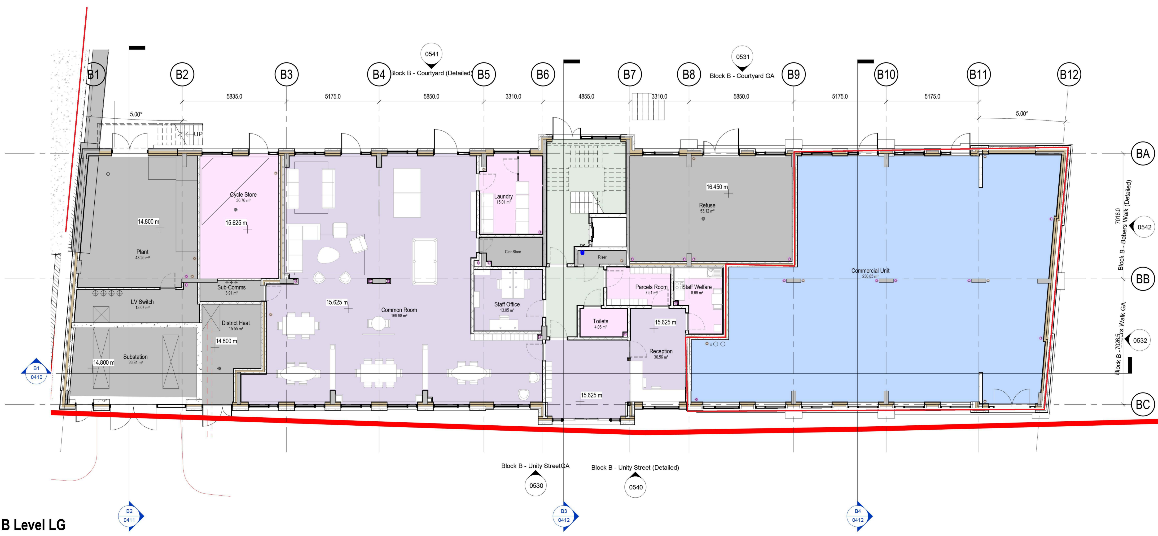
Block B Level LG 1 : 100

Client Watkin Jones PLC Project Unity Street, Bristol Title Block B - Lower Ground Status Construction Project number 1074 Date 10.02.20 Drawn by JD Checked by AB Scale 1 : 100@A1 Revision I Drawing No. 1074-TGA-XX-LG-DR-A-0330 11/5/2021 9:28:21 AM