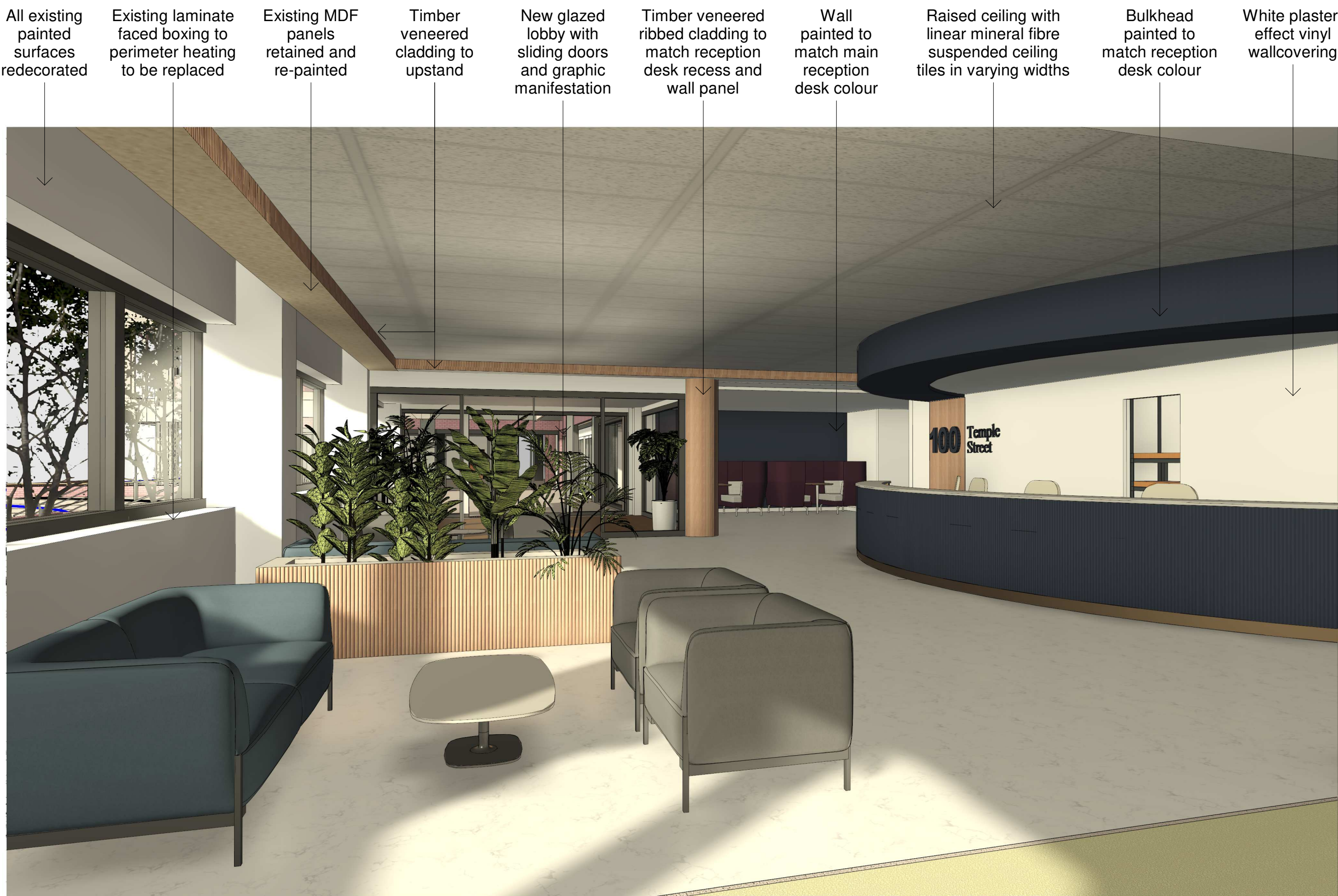
View of Reception from Temporary Partition