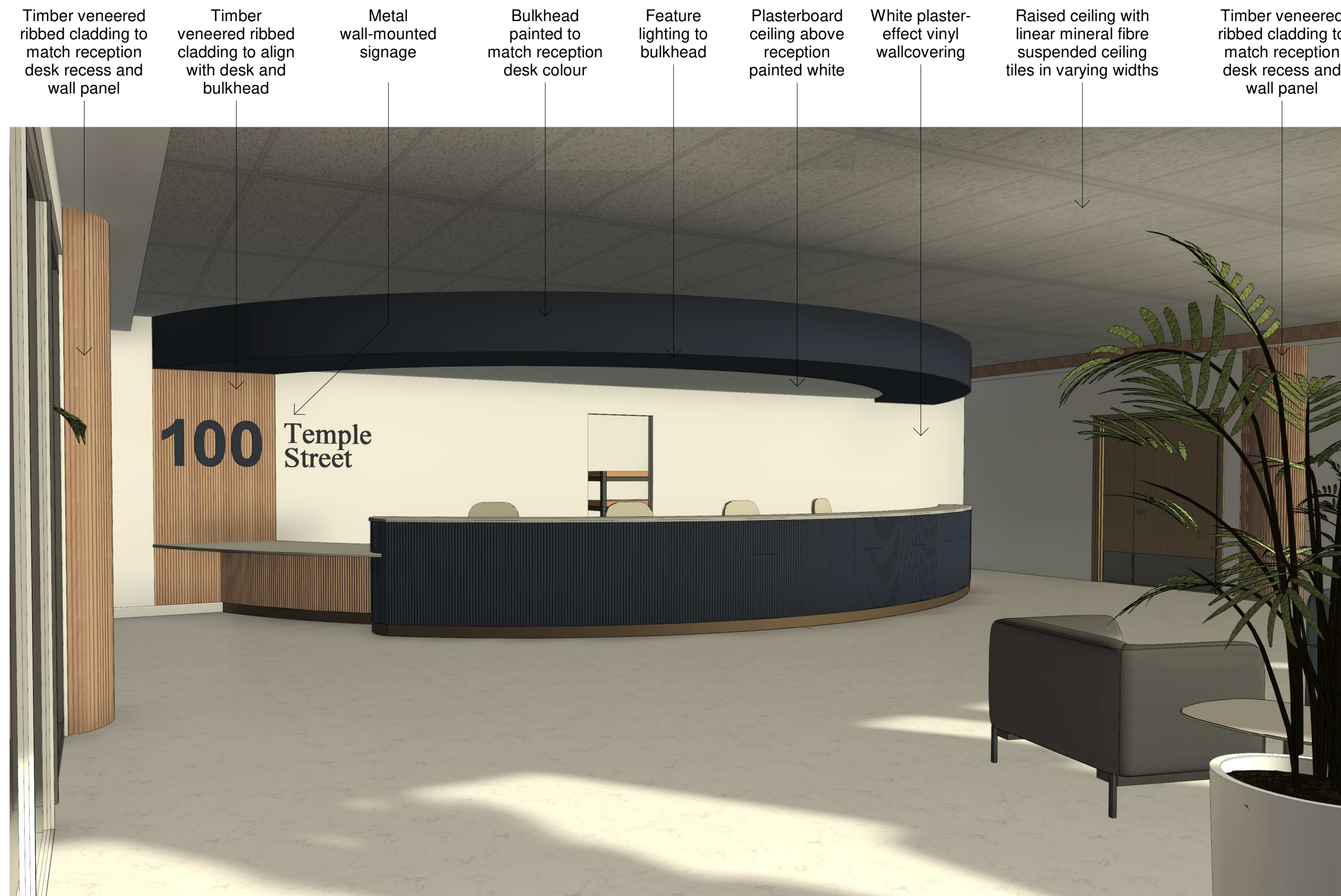
View from Lobby to Reception Desk