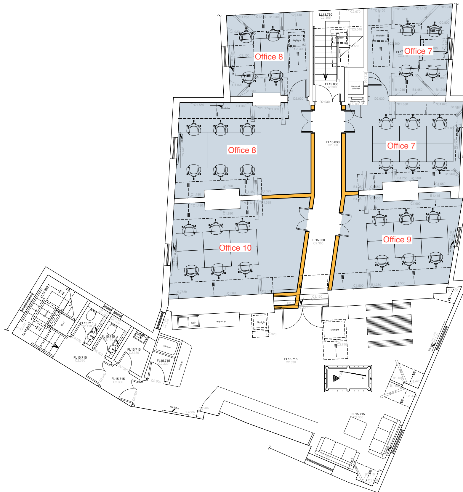
THIRD FLOOR PLAN GROSS INTERNAL AREA 247.16m 2 NET INTERNAL AREA 202.13m 2